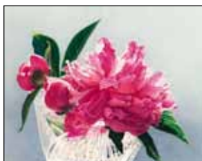
Iris Stripling, CPSA