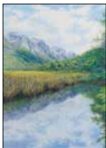
Paula Parks, CPSA Shoreline WA Mirror Lake Colored Pencil • $750