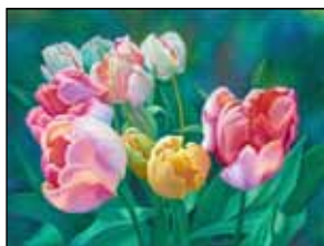
Paula Parks, CPSA Shoreline WA Signs of Spring Colored Pencil • $950