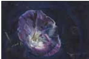
Kathryn Ann Koozer Seattle WA Kaleidoscope Colored Pencil & Pressed Flowers • $900