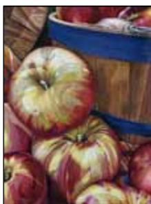
Kathryn Ann Koozer Seattle WA Farmer's Market Colored Pencil • $1250