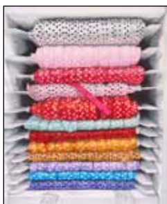
Brenda Raub Mountain Home ID Ribbons Colored Pencil • $1600